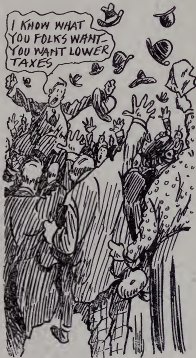
A CANDIDATE GUESSIN' IT TH' FIRST TIME