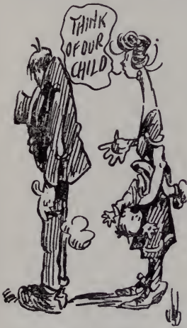
SOFTENIN' AN OBDURATE HUSBAND

Children are great institutions. They don't only half way hold a home t'gether fer a few years, but they give parents somethin' t' think about besides cards.