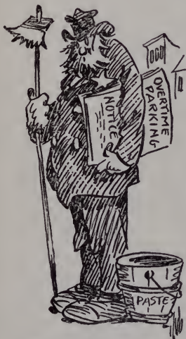
CONSTABLE PLUM IN ACTION

inals. In so fer as regards that's concerned, ther hain't nothin' into it. Lack o' home trainin,' lack o' watchfulness on th' part o' parents, may result in pranks an' little misdemeanors on th' part o' youngsters, but th' worst defaulters an' sharpers an' sneaks I've ever knowed had good folks. Some o' them wuz educated fer th' ministry, an' all o' them had been home trained right down t' th' minute. Ole Allison Peabody,