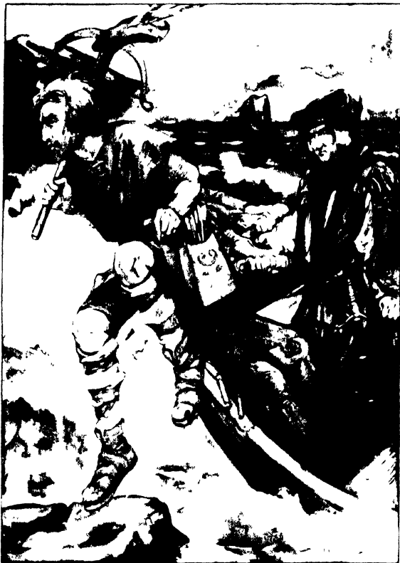
100. The man pressed his foot against the rock.