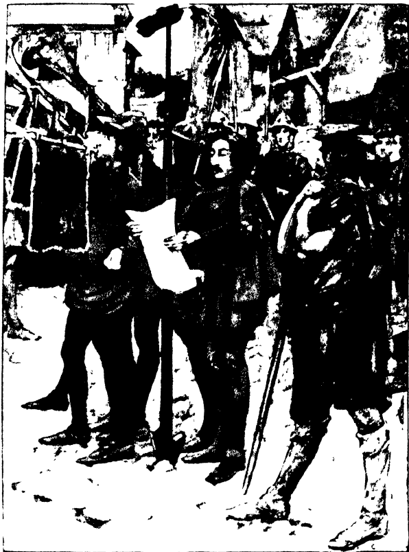
A gayly clad herald stepped out from the crowd