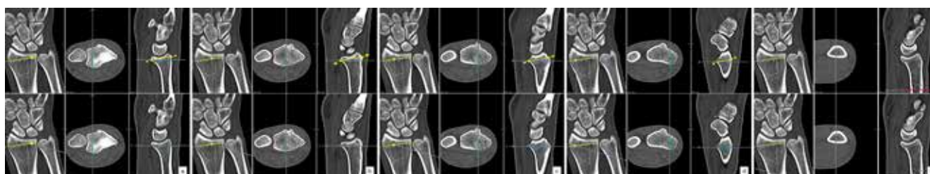
Figure 2. Measuring epiphyseal (a-d, yellow line with dots) and diaphyseal (e, red line with dots) screw lengths.

CT analysis study to determine the epiphyseal screw lengths, not specific to any commercial plate design, but which may be applicable to most of the available plates. This may seem like a potential error, but we think that the measurements of the distal radius may be a valuable guide for surgeons, since the screw length measured cortex to cortex in locking plates, to avoid tendon complications while performing volar plate surgery. Previous studies have measured the length of the epiphyseal screws placed perpendicular to the plate [11]. In this study, measurements were made for screws with a fixed 10 degrees angulation. Screw angulation can be manipulated in several commercially available plates, thus may alter the epiphyseal screw lengths. Additionally, we designed our study to position epiphyseal screws 4.5 mm proximal to the radiocarpal joint line. More proximal placement of the volar plate may also alter screw lengths. Moreover, it should be kept in mind that ethnicity changes may result in different anatomic features, and therefore measurements may differ. This technique may not be practical for the surgeons preferring to apply the distal epiphyseal screws first as an aid for reduction. On the contrary, a predetermined screw length can be a helpful guide for safe screw placement and secure fixation.